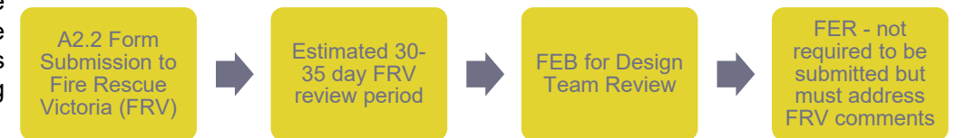
Figure 2 Referral process for Victoria without Reg 129